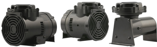
L & K Series Products